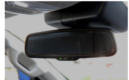
AUTO-DIMMING MIRROR & DASHCAM POWER OUTLET.