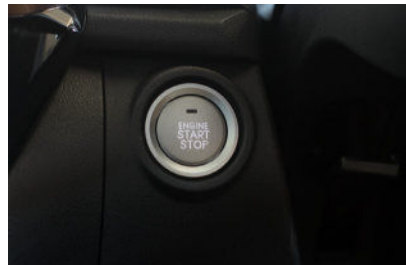
SMART KEYLESS ENTRY AND A PUSH START BUTTON.