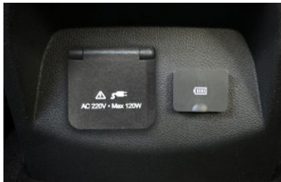
220V POWER OUTLET.

The ACC automatically adjusts the vehicle speed to maintain a safe following distance.