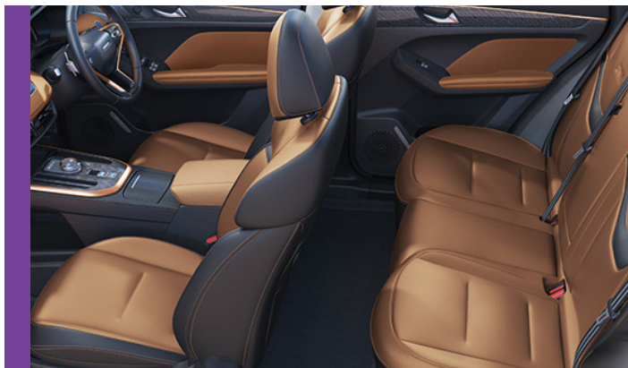
Black and Brown