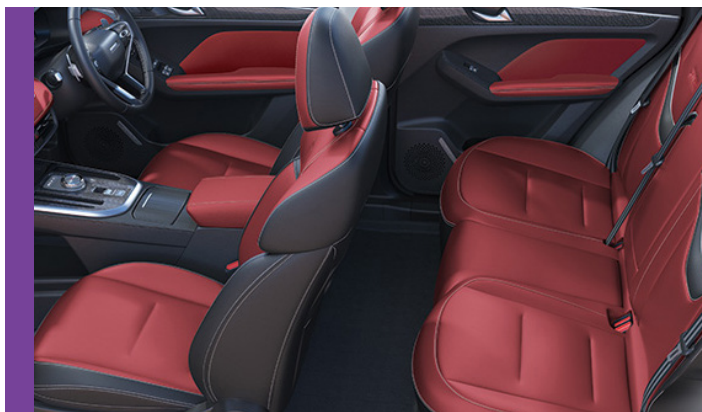
Black and Red

* Available on selected models only Luxury and Super Luxury grades