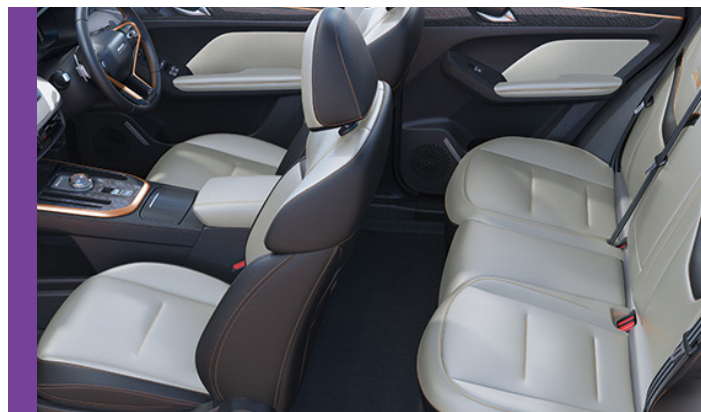
Black and Grey

* Available on selected models only Luxury and Super Luxury grades